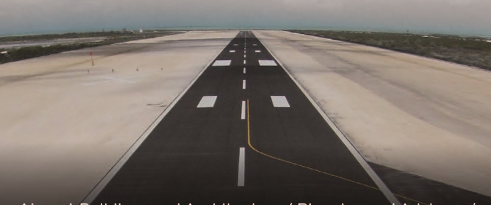
Airport Buildings and Architecture / Planning and Advisory / Civil Engineering and Electrical Engineering / Aviation Specialty / Project Management

Airports are critical infrastructure. Let us help you spread the message.