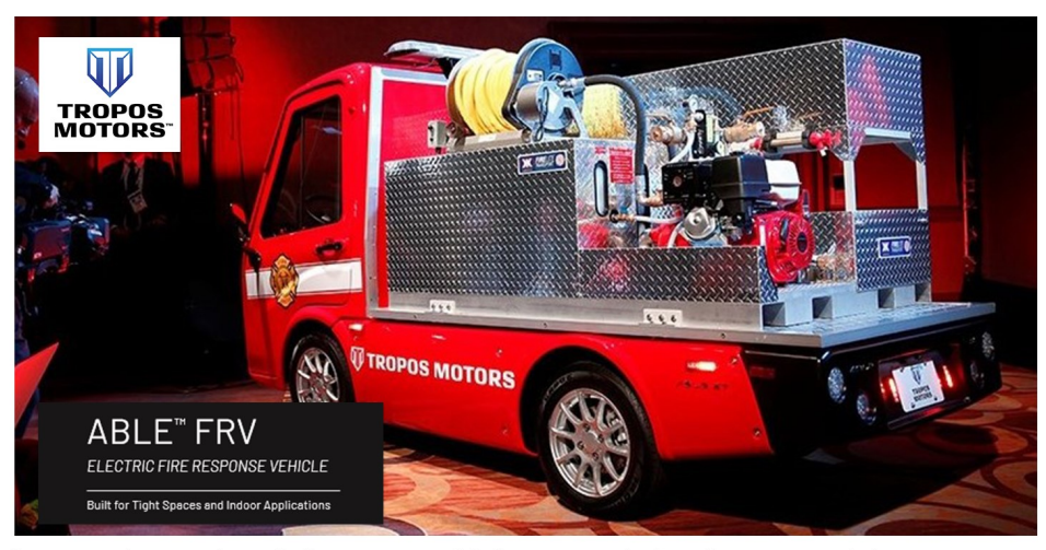
"Compact Electric Utility Vehicles are a natural fit for us, Not only does the ABLE eCUV help our customers meet their sustainability goals, but it gets the Big Jobs Done." says Noel Nagora, Cubex Branch Manager

The ABLE™ FRV is ready to serve in spaces large or small, indoors or out, & is equipped with a Kimtek® Firelite® Transport FDHP-301-125: an industry proven unit with a low-profile and low center of gravity.