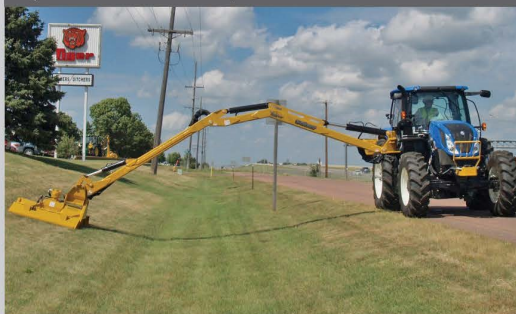
Tiger Mid Mounted Boom Mowers up to 30'