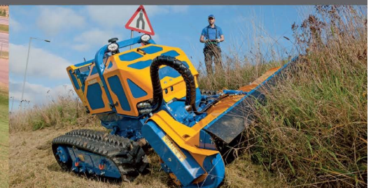
Bomford Flailbot Remote Controlled Steep Slope Mowers