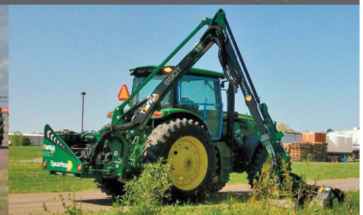
Spearhead Rear Mount Mowers Available up to 30' Reach