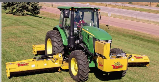
Tiger Tractor Mounted Triple Flail Mowers

Call us today to schedule a consultation: 1.855.449.5858