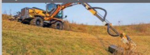
Energreen Alpha Professional Vegetation Management