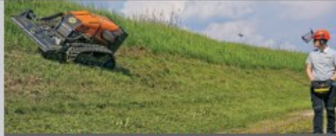
Energreen Robo Remote Controlled Steep Slope Mower

Contact us today at 1.855.449.5858 or sales@colvoy.com