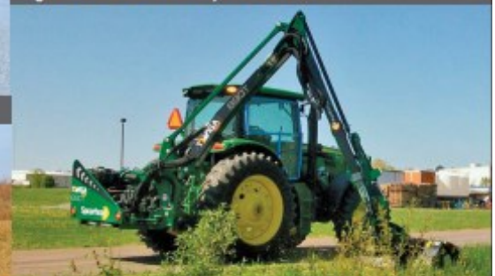
Spearhead Rear Mount Mowers Available up to 30' Reach