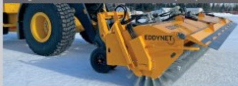
Eddynet REVV Airport Sweeper