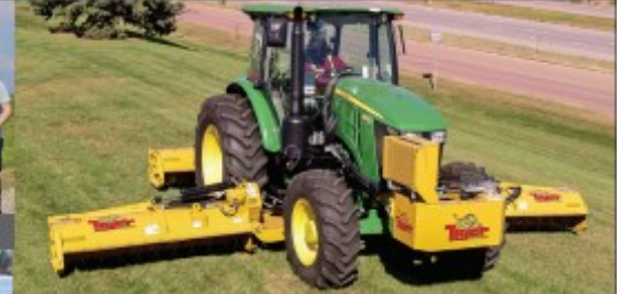
Tiger Tractor Mounted Triple Flail Mowers