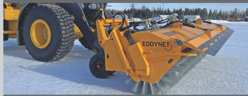
EddyNet Airport Sweeper