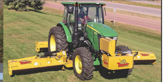
Tiger Tractor Mounted Triple Flail Mowers