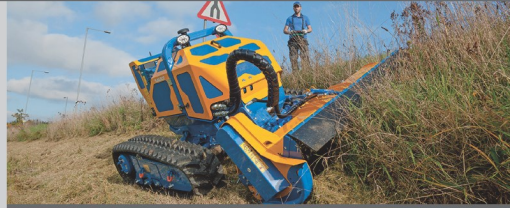
Bomford Flailbot Remote Controlled Steep Slope Mowers

Contact us today at 1.855.449.5858 or sales@colvoy.com