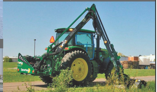
Spearhead Rear Mount Mowers Available up to 30' Reach