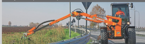
Energreen ILF Kommunal — up to 9 Meter Reach