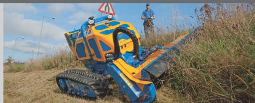
Bomford Flailbot Remote Controlled Steep Slope Mowers

Contact us today at 1.855.449.5858 or sales@colvoy.com