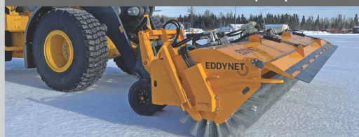
Eddynet Airport Sweeper