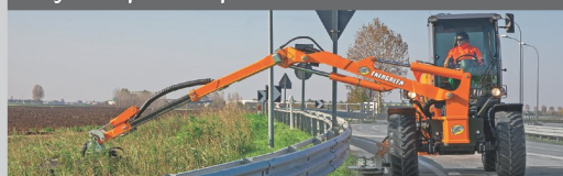
Energreen ILF Kommunal — up to 9 Meter Reach